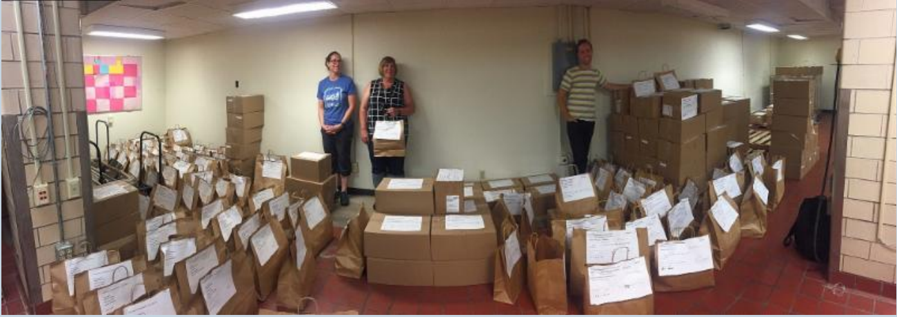
Partners in Giving Loaned Executives (LE's) stand by campaign materials ready for delivery to the UW! The distribution starts Thursday and packets will arrive at UW by end of Friday.