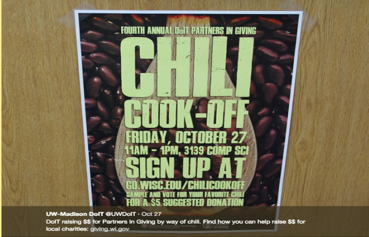
A sizzling hot Chili Cook-Off hosted by UW-Madison Department of Information Technology (DoIT) raised a cool $1,000 for Partners in Giving!