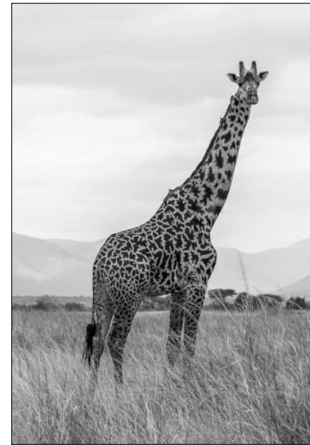
African Wildlife Foundation

Working to protect health and the environment, including air, water, land, and food, to lead the transition to a world free of toxic pesticides. www.beyondpesticides.org