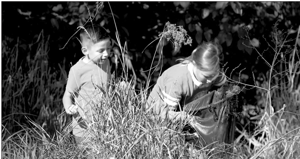
Wisconsin Wetland Association