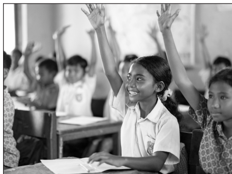
Water for People

Operates globally, working side-by-side with health care workers and their communities, addressing the greatest public health challenges enabling people to live their best lives. www.projecthope.org