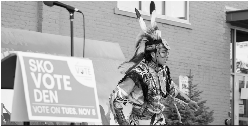
Wisconsin Conservation Voices

Envisions all people growing and thriving in healthy, equitable, and sustainable neighborhoods. Our work and collaborations are rooted in food, land, and learning. www.rootedwi.org