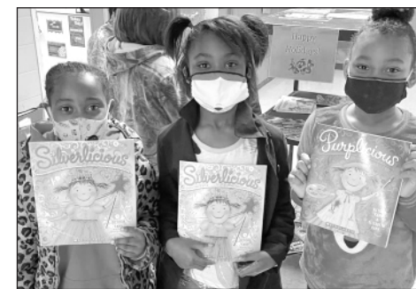
Reading is Fundamental Inc. (RIF)

Provides books for children nationwide and engages children, parents, and communities in reading and motivational activities to encourage a lifelong love of reading. www.rif.org