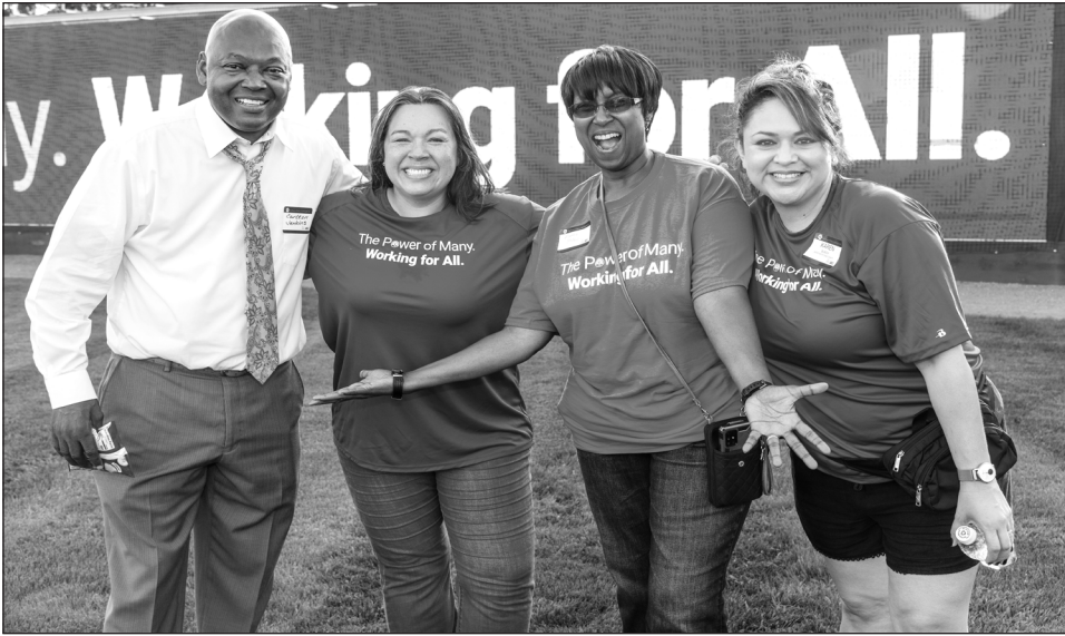
United Way of Dane County, 2022 Community Kickoff

Provides innovative, women-responsive, strength-based, family-focused, community-based, wraparound services to women and their children since 1976. www.arccommserve.com