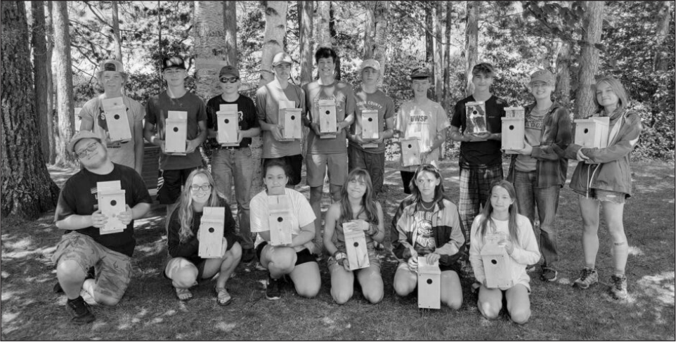
High School Conservation Camp, Wisconsin Land & Water Conservation Association