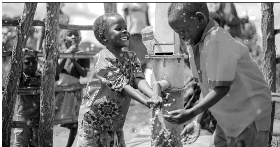
Children playing at an Amref borehole.