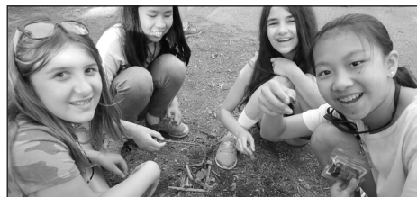
Middle School Conservation Camp, Natural Resources Foundation of Wisconsin

Engages, educates, and empowers the next generation of land stewards for a healthy and sustainable future by offering a wide variety of programs to ensure ALL children have access to nature. www.aldoleopoldnaturecenter.org