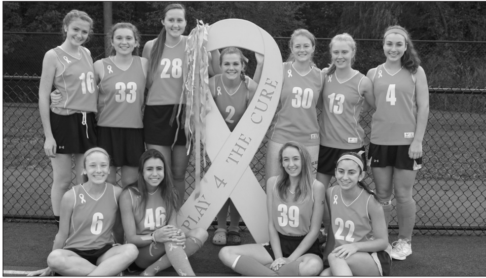
Cancer Research America-NFCR

Funds the majority of research on this disease, produces patient materials, and promotes public awareness of alopecia areata. www.naaf.org