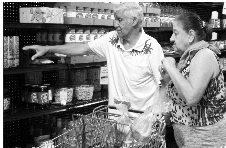
Hunger Relief Fund of Wisconsin (administered by Hunger Task Force, Inc.)

For 46 years St. Ben's has served homemade food to Milwaukee's homeless and working poor; 2,000 individuals join St. Ben's table six days a week. www.capuchincommunityservices.org